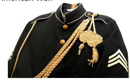
Spanish American War Uniform.

discharged on July 21, 1910 after serving eight years in the Philippine— American War.